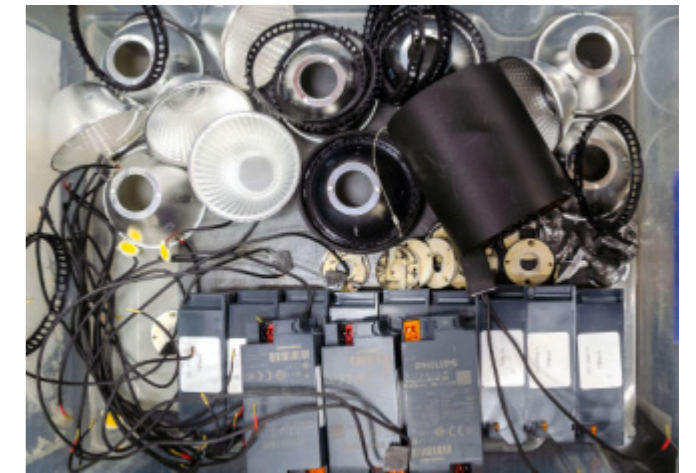
Old LEDs, drivers & damaged components removed for recycling