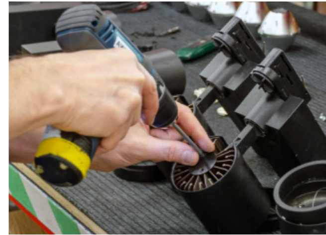
Each luminaire disassembled and inspected