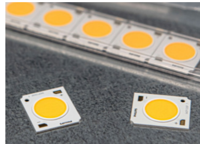
Salvaged components cleaned and reassembled with new LED module, driver and reflector