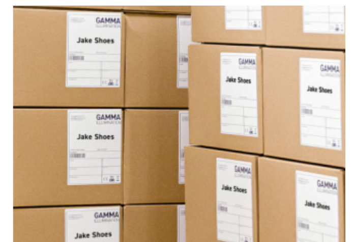
... packed and returned to site