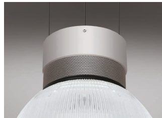
/GG Grey, Grey