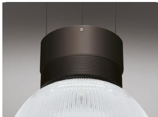
/BB Black, Black