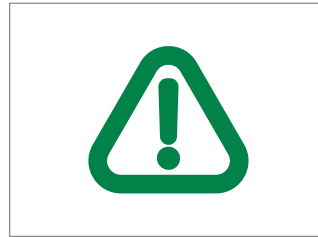
Emergency conversions Contact Sales