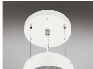
/5M 5 m suspension kit