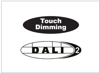
/T+DALI Touch dimming / DALI