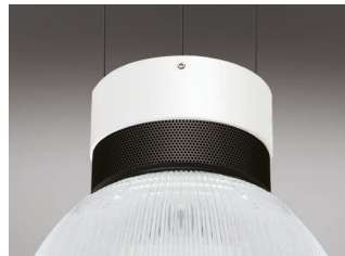
/WB White, Black