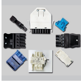
PV - Contact Sales Choice of connectors