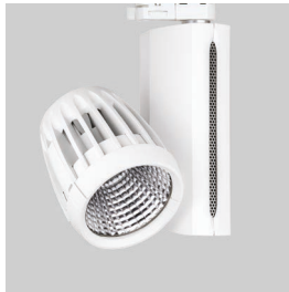
See LTS / LTT Track spot