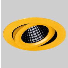
PV - Contact Sales Any RAL colour bezel