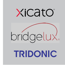
PV - Contact Sales Choice of modules