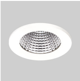
See TTS / TTT Downlight