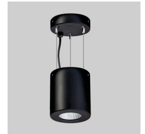
See AHA Suspended downlight

Thornhill Road Business Park Tenter Fields, Dewsbury West Yorkshire WF12 9QT +44 (0)1924 482777 www.gamma-uk.com