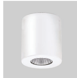
See AHA Surface downlight