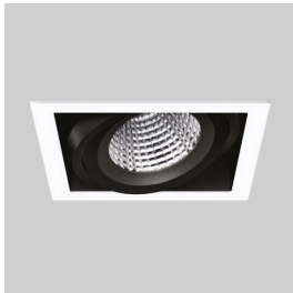
See ABA / ABB Framelight