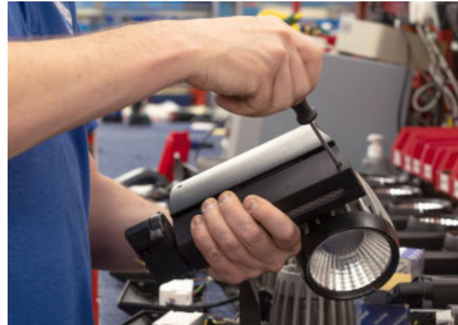
Each luminaire was disassembled and inspected