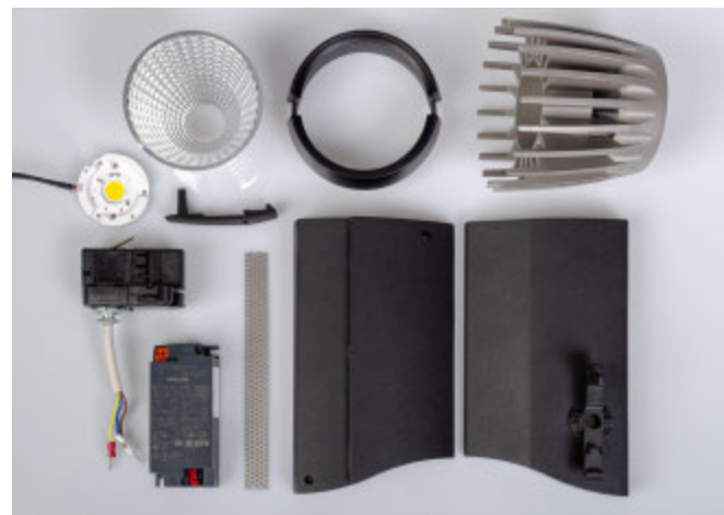
...ready for reassembly