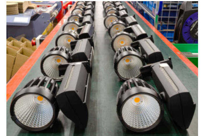
... and inspected