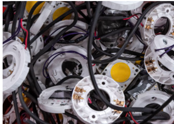
Old LEDs and drivers removed for recycling