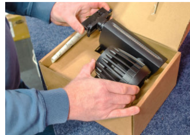
Each luminaire individually packed...