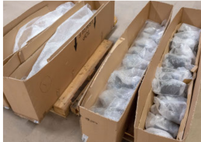
Luminaires start returning from site