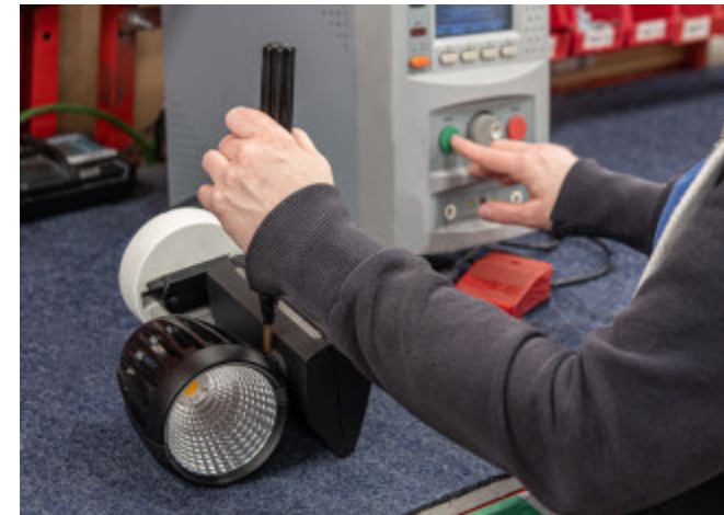
Each luminaire tested...