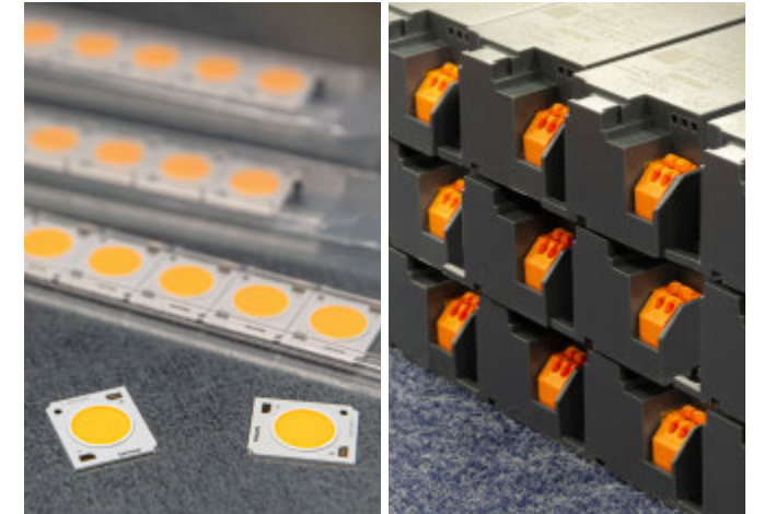
... with new LED components