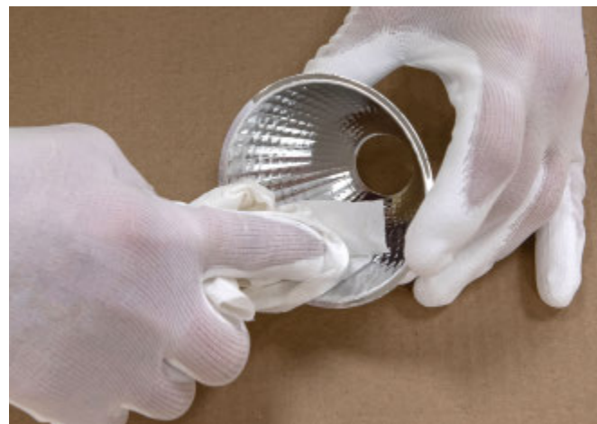
... and polished...