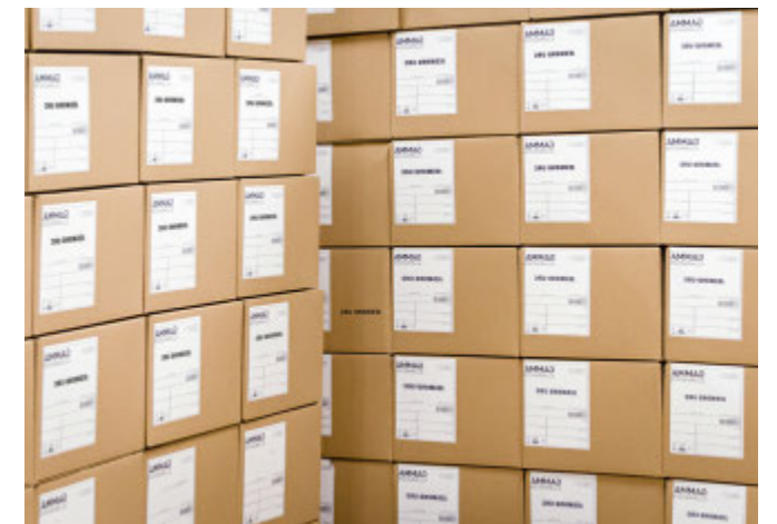
... and returned to site within 4 days