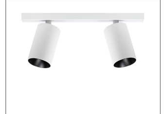
/TW Twin body