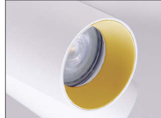
/GB Gold baffle