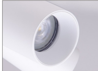
/WB White baffle