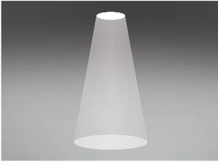
/NB 25° narrow beam reflector