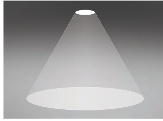
/WB 60° wide beam reflector