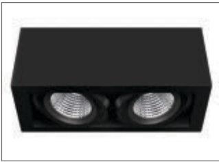
/BK Black body and gimbal