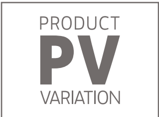
Product variations Other colours and specifications available on request