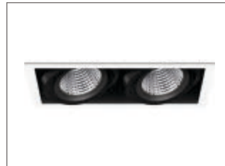
Recessed available See Fame ABA and ABB