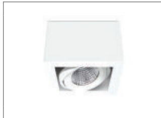
Single available See Fame AFJ