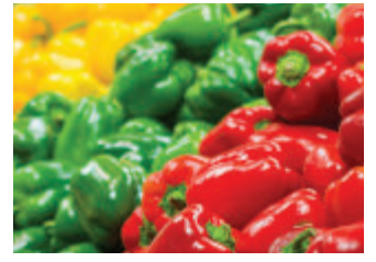
/R9 High colour rendering (R a 90)