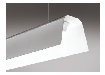
/G Grey satin outer, white satin inner