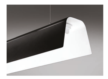
/B Black satin outer, white satin inner