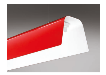
/R Red gloss outer, white satin inner