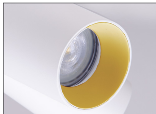
/GB Gold baffle