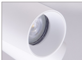
/WB White baffle