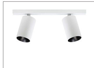
/TW Twin body