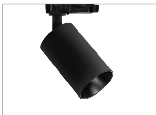
/TK 3 Circuit Track mount