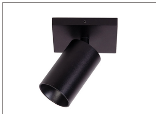
/BL Black body