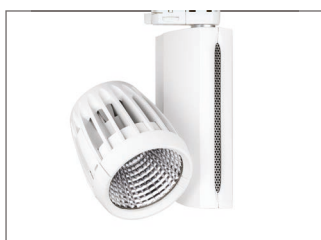
/WH White - RAL9016