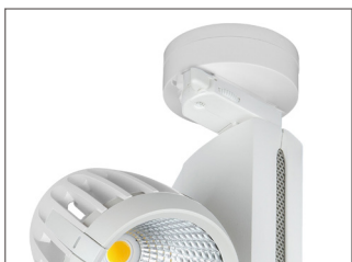
9000/BP-D-W Surface mounting pattress - White