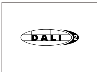
/DALI DALI dimming