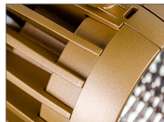
Product variations Other colours and specifications available on request