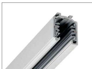
Track See Stucchi ONETRACK datasheet

Thornhill Road Business Park Tenter Fields, Dewsbury West Yorkshire WF12 9QT +44 (0)1924 482777 www.gamma-uk.com