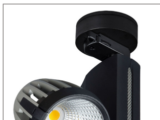
9000/BP-D-B Surface mounting pattress - Black