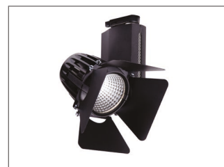
/BD Barn doors