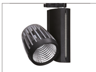
/BKGY Black - RAL9005 / Grey - 9007