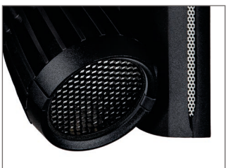
/HC Honeycomb louvre