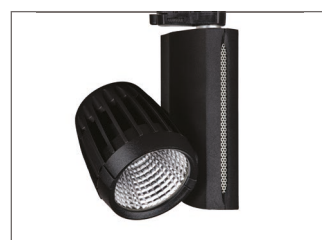
/BK Black - RAL9005