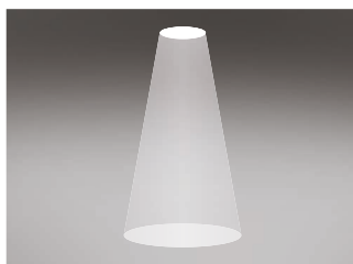
/NB 24° narrow beam reflector