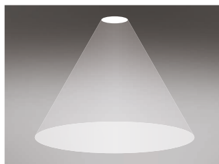
/WB 60° wide beam reflector