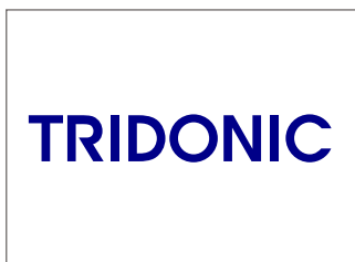
Tridonic modules See Lingo LTT datasheet